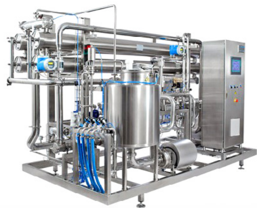
Figure 1 – MF membrane skid

The relative dimensions of the process species under consideration are depicted in Figure 2.